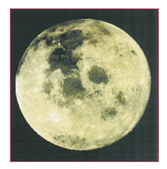
Apollo 17 Mission to The Moon

The rate of influx of cosmic dust had been known within reasonable limits. If the moon really were 4.5 billion years old, the depth of dust would have been great and a real hazard for the Apollo astronauts. However, it is clear now that here is only few thousand years of dust on the surface of the moon.