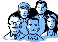
Body of Christ

Matthew 16:18 --- Acts 20:28 --- Ephesians 1:22-23